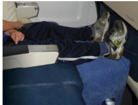
1st Class Kids